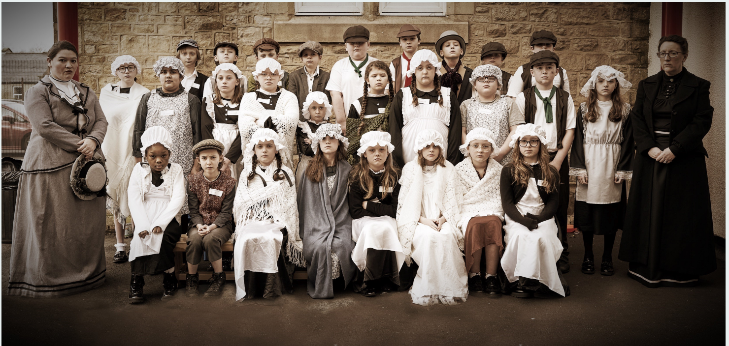
Year 5 enjoyed Victorian Day last week. Their costumes were fabulous!